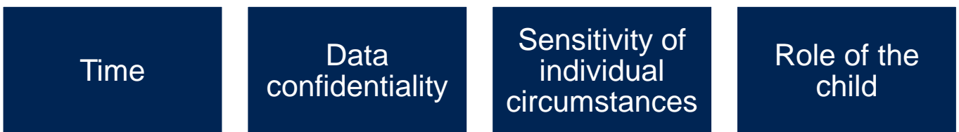
Figure 3.2: Four barriers to participation (not shown in any particular order)

Each of the above barriers is discussed in turn below.